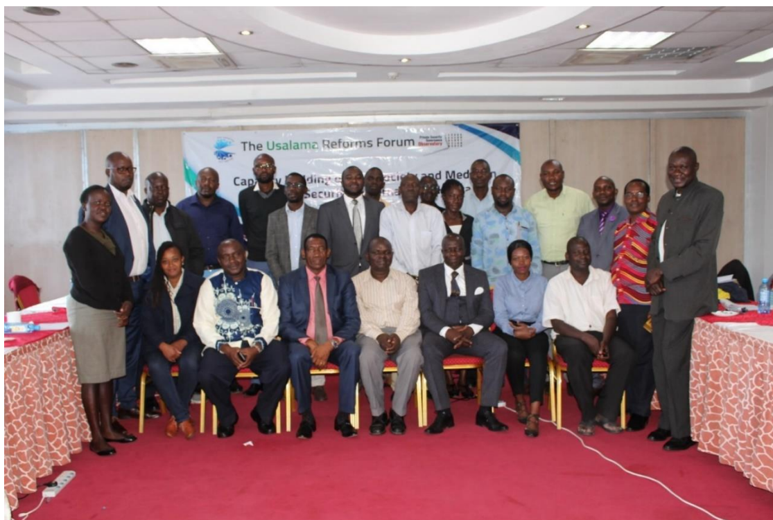
A group photo of all the participants of the CSO and Media Capacity building workshop in Nairobi, Kenya.